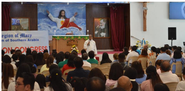
7th Legion of Mary Congress Held on 30-Aug-2019