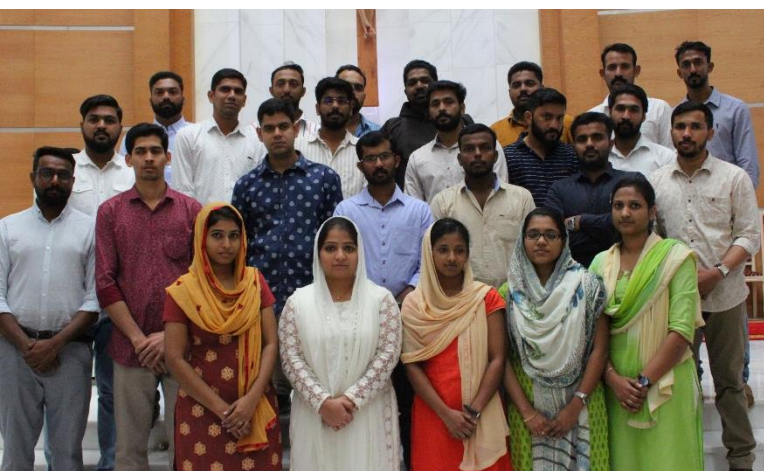
Marriage Preparation Course In Malayalam 3 rd Batch,