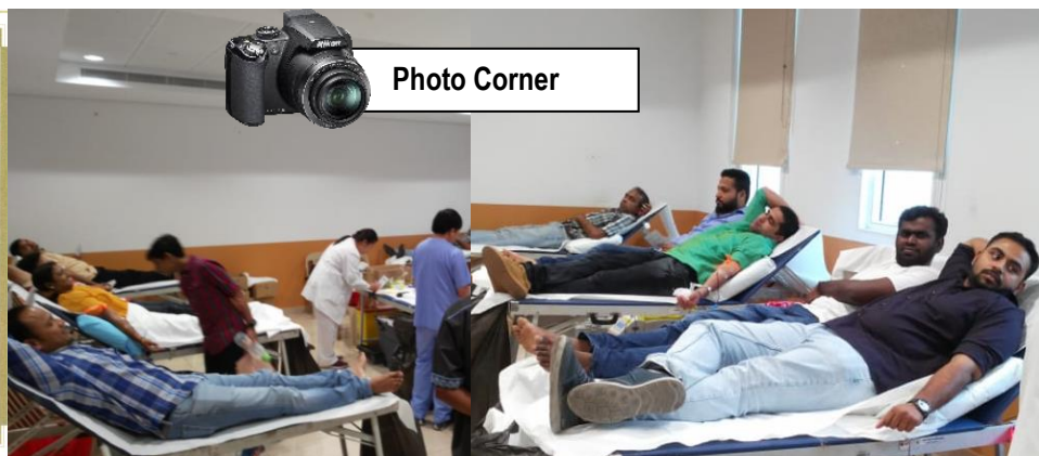
Blood Donation Camp Held on 16-Aug-2019, 154 Parishoners Donated