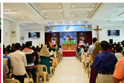
G Net Christeen Retreat Held on 23, 24 & 25-Aug-2019